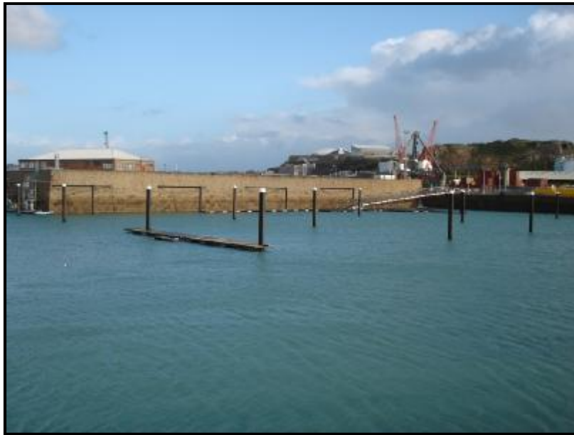
Pontoons removed as at 13 th December.