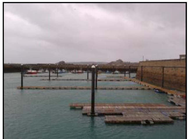
New pontoons installed as at 20 th January