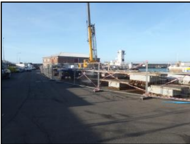
Site compound on Victoria Pier.